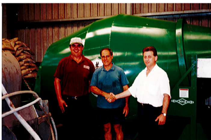
New Doyle blender installed in Tropiculture - Darwin