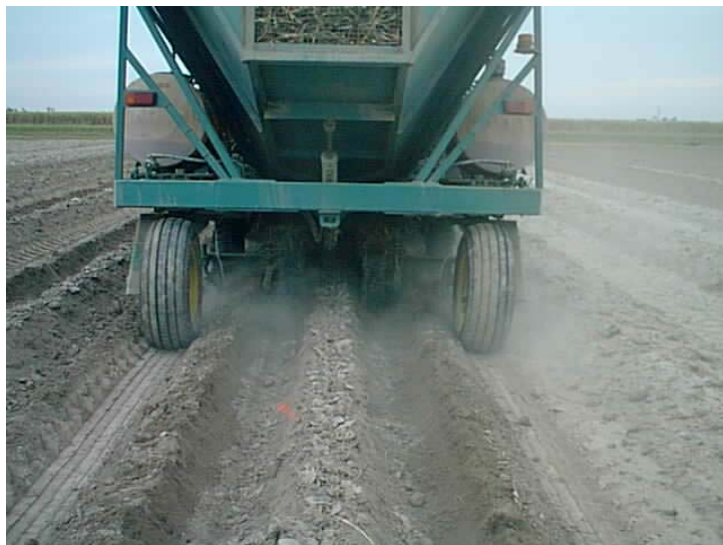
Figure 1: Planting of site two (dual row).

Reefsafe®/Agrispon® was applied to the plant billets as they were dropping through the planting chute. The Reefsafe®/Agrispon® rate of 1L/ha was determined by the width of the planter shoot furrow.